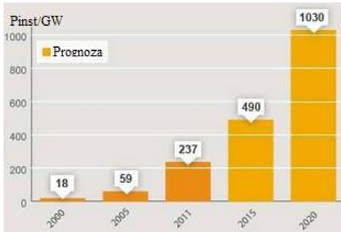
Figure 1: Global installed wind capacity (MW)